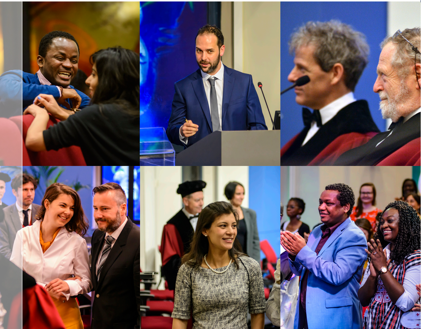
UNU-MERIT | MGSOG | | Concept and design template: Vormgevingassociatie BV, Hoog-Keppel | Although this brochure was made with the utmost care, no rights can be attained from it.